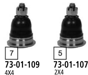
7 73-01-109 4X4