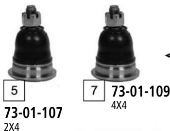
5 73-01-107 2X4