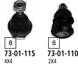
8 73-01-115 4X4